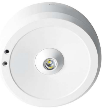
STARLET EXTERNAL SO