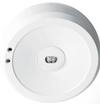
STARLET EXTERNAL SC