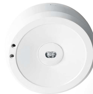
STARLET EXTERNAL SC