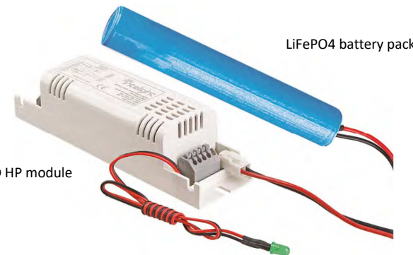
PRIMUS LED HP module

Installation and maintenance instructions