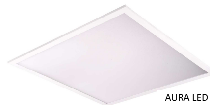
AURA LED 60X60

Installation and maintenance instructions