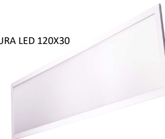
AURA LED 120X30